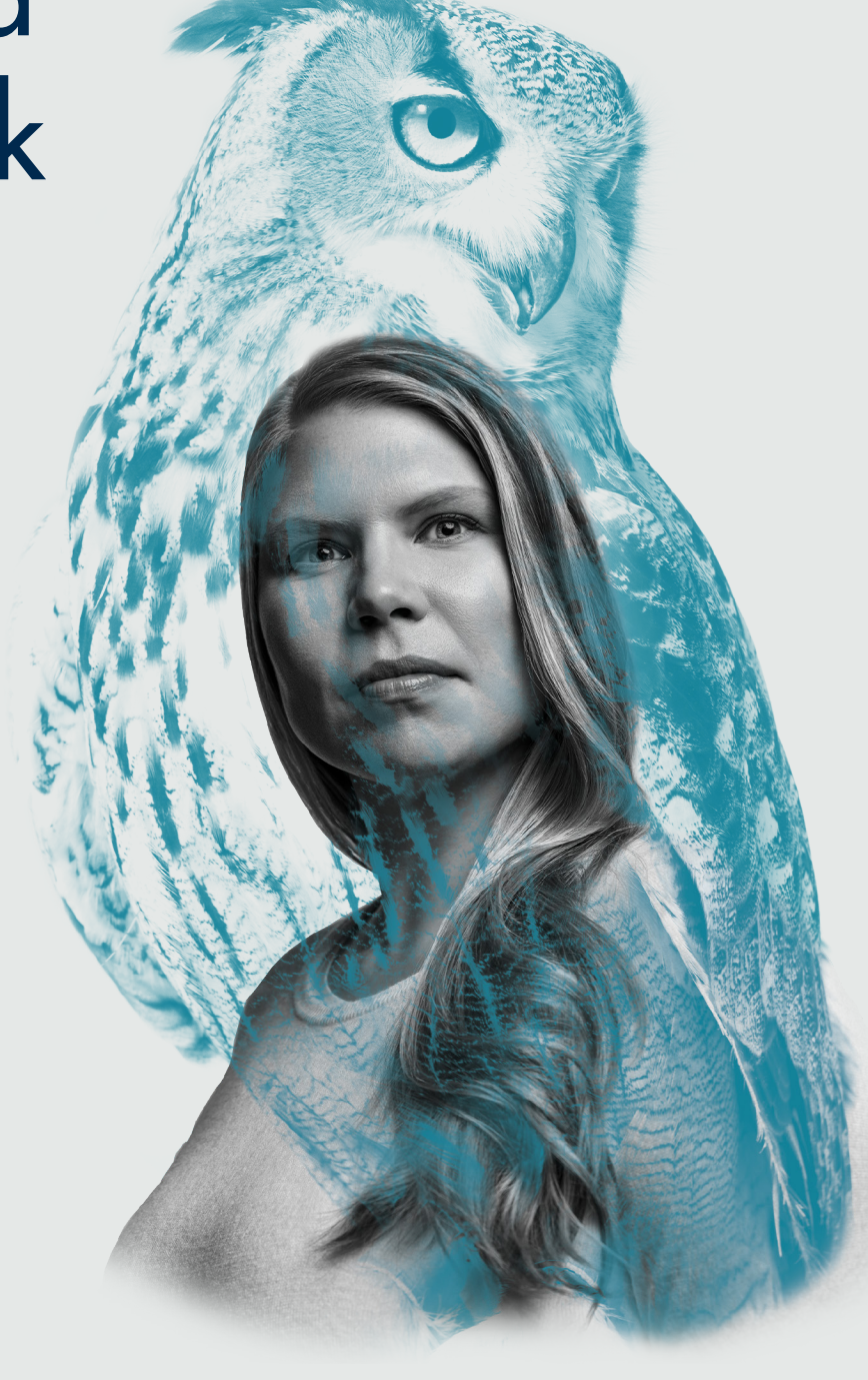
Crystal A. B.A. Special Education M.A. English Language Learning

Eligibility to apply for the Pathway to Teaching Scholarship valued at up to $5,800